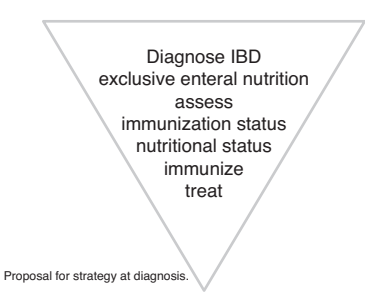
FIGURE 2. Proposal for strategy at diagnosis. IBD = inflammatory bowel disease.

In pediatrics, exclusive enteral nutrition (EEN) is considered a valuable alternative for induction therapy (64). Interestingly, mucosal healing has been demonstrated with EEN in children as well as in adults (Beattie RM, 1994 #103; Fell JM, 2000 #97). In a recent prospective randomized controlled trial in children with active CD, a polymeric diet for 10 weeks was markedly superior to corticosteroids in promoting healing of inflammatory lesions of the gut (65). A strategy using enteral feeding therapy to create a window for immunization should therefore strongly be considered. At diagnosis, the initiation of EEN would allow time for assessing